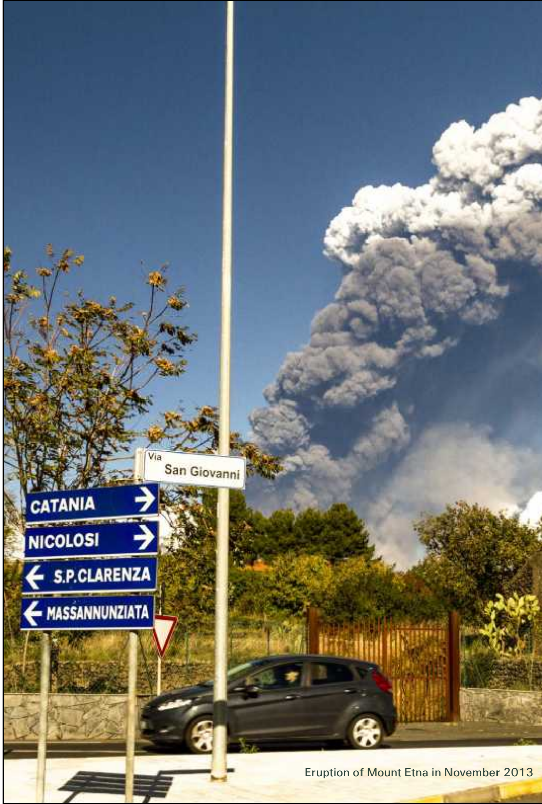
Eruption of Mount Etna in November 2013