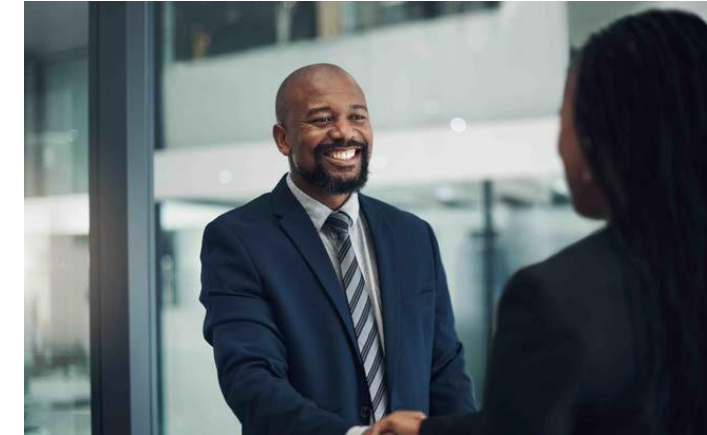
POLICY, REGULATORY & INDUSTRY ENGAGEMENT