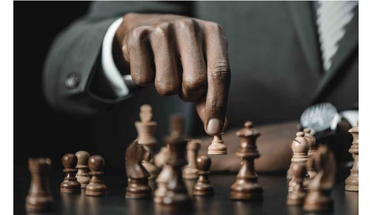
SUSTAINABLE INSURANCE THINKING & PRACTICES